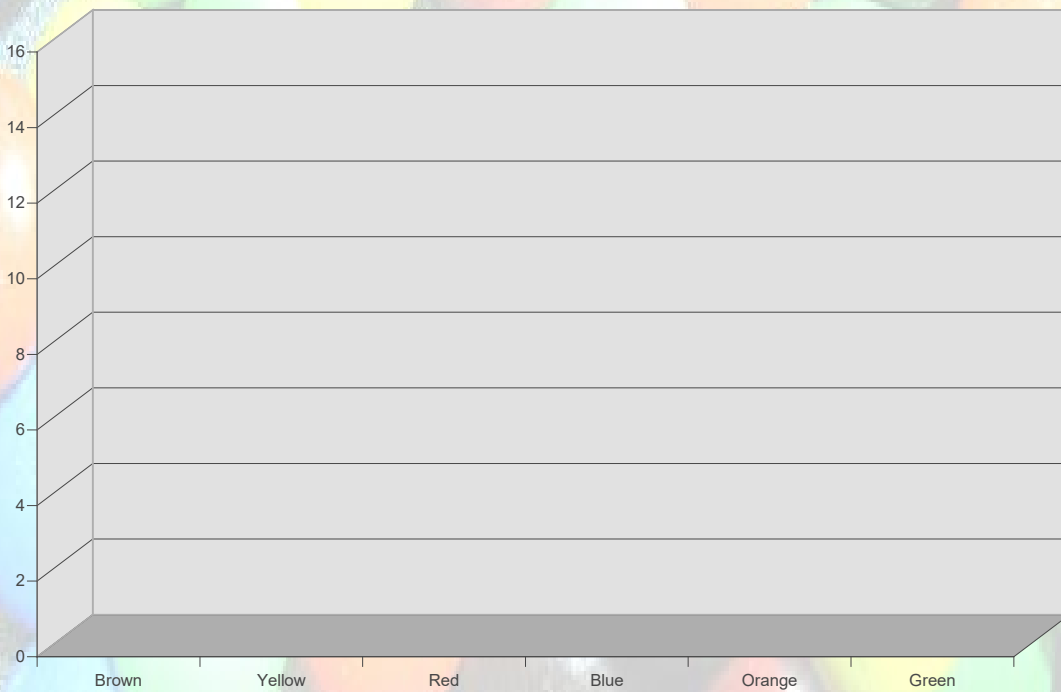
Bar Graph of My Bag

Using the graph below draw a histogram charting your actual number of M & M's for each color.